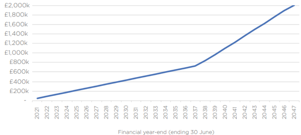
Total cumulative community payments

It is important to point out that community fund payments are not guaranteed and are subject to the ongoing performance of the Group and solar farm